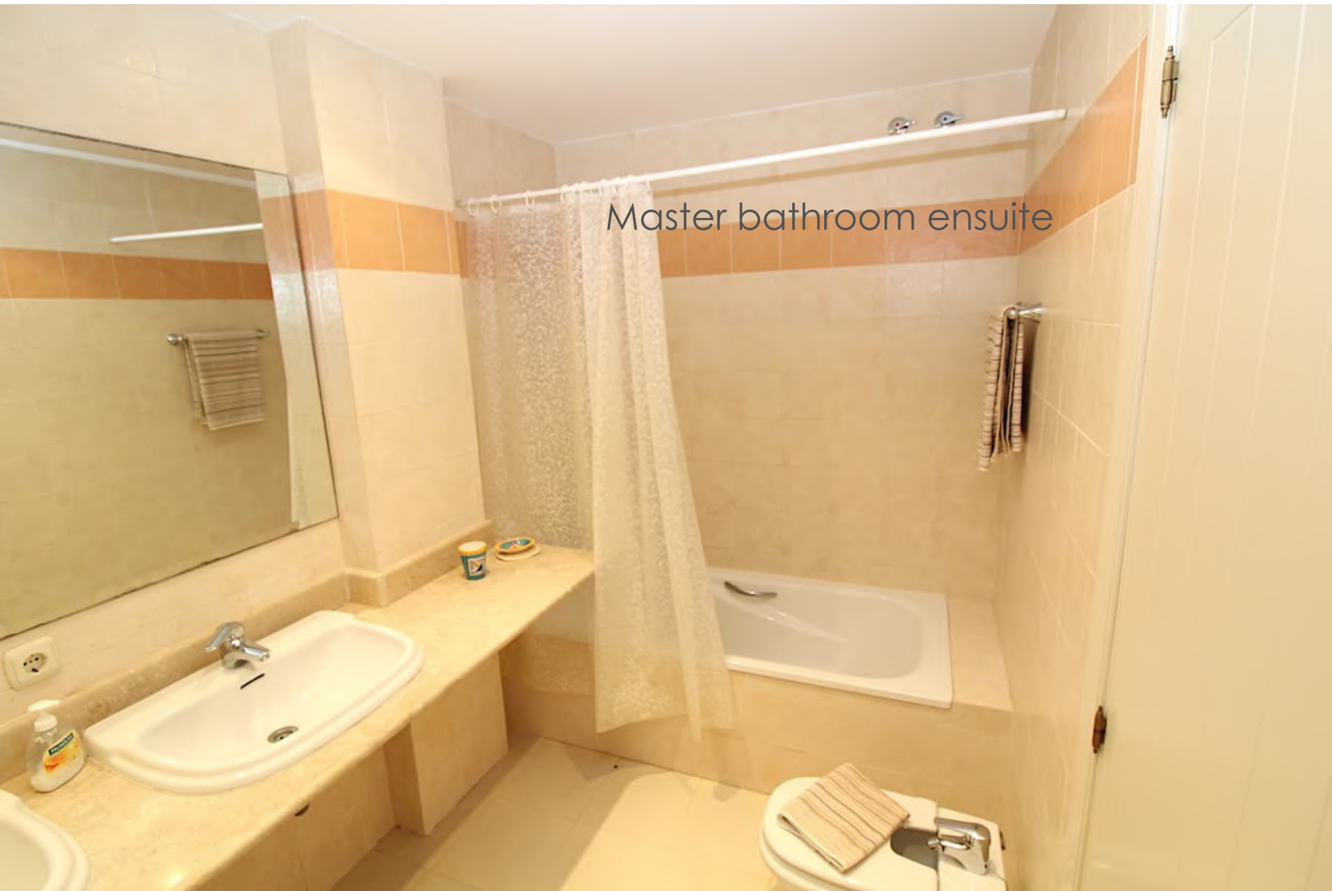
Master bathroom ensuite