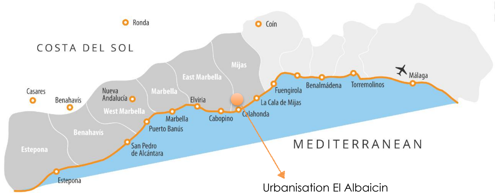
Urbanisation El Albaicin